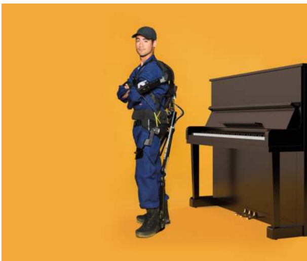
HUBOT EXAMPLE JOB: EXOSKELETON MOVER

Inside the job agency, our trained staff will invite the visitor to take a career test. After the job choice has been confirmed, a robot will guide the visitor to the selected profession. Here the visitor will find the technology required for the job and receives more information about the profession.